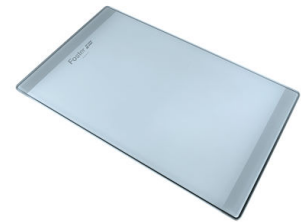
PLANCHE DE DECOUPE CRYSTAL

* only in combination with the accessory A644 F04